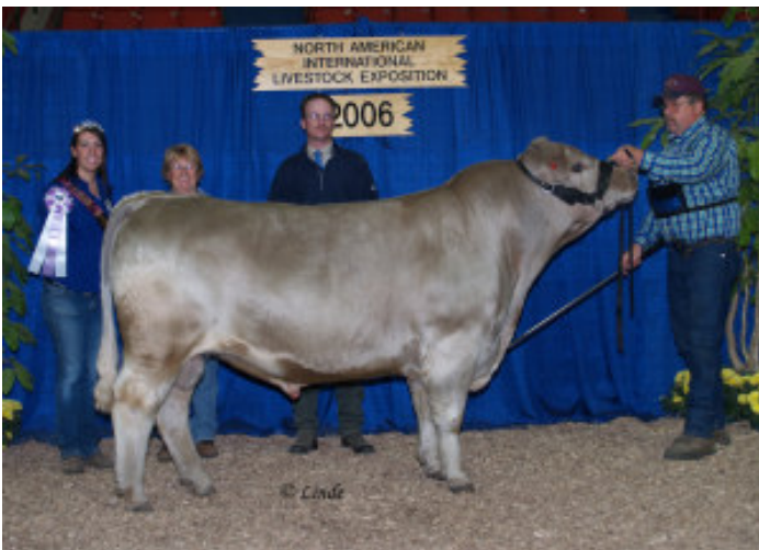
HA Rocky Intermediate Champion Bull Reserve Grand Champion Bull Bred & Owned by Hillside Acres