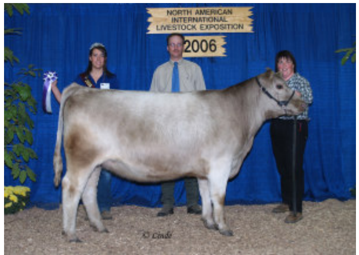
RSA Ms Regale Duchy 65R Senior Champion Female Grand Champion Female Bred & Owned by: RebSuAnn Cattle