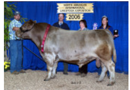
JVN Vernon National Grand Champion Bull 2006 Murray Grey Supreme Champion Sire: Monarch Oak Extra