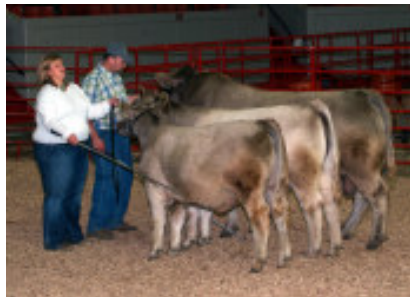
National Show Get of Sire Award Monarch Oak Extra