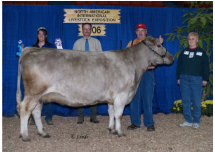
WCC Miss Canadian Breeze 63M Champion Cow Reserve Champion Female Bred by: Willow Creek Cattle Co. Owned by: Diamond G Murray Greys