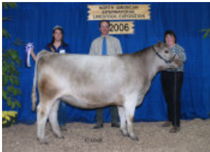
RSA Ms Regale Dutchy 65R National Grand Champion Female Sire: Monarch Oak Extra